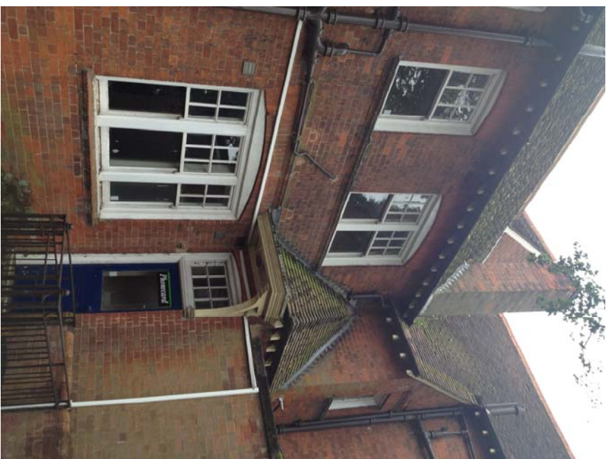
existing site photograph