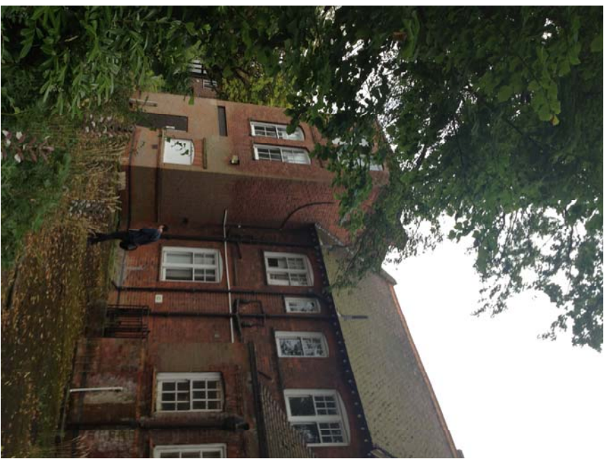
existing site photograph