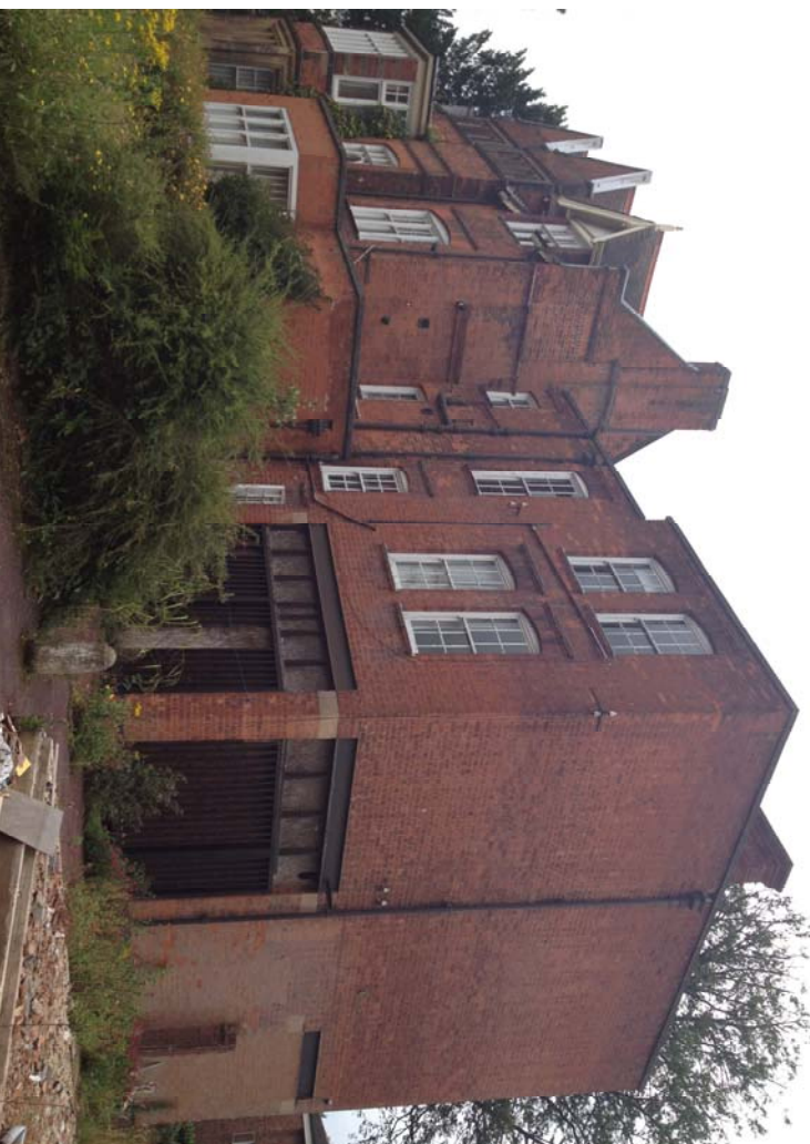
existing site photograph