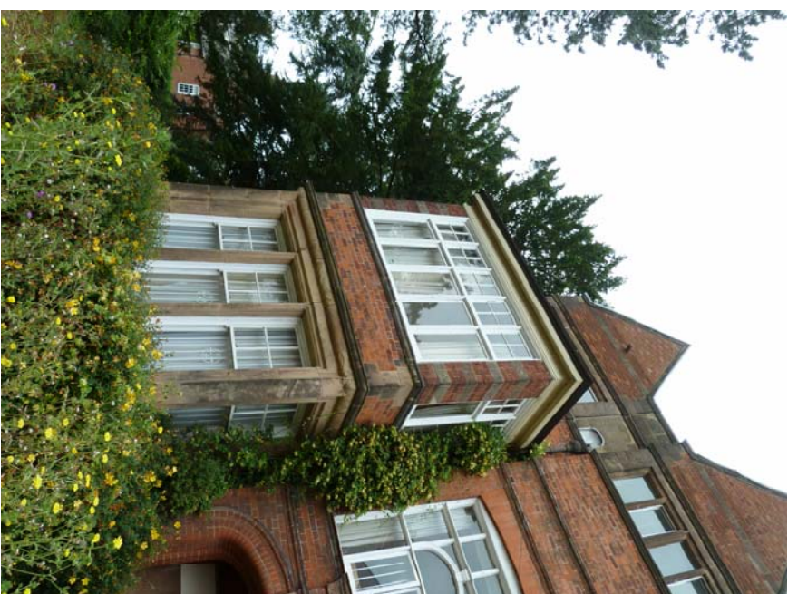
existing site photograph